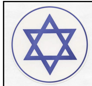
(3 ¾ inches)